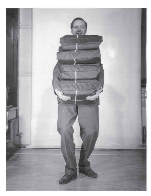
Figure 4: Professor Desmond Laurence and his monthly burden of documents for a meeting of the Committee on Safety of Medicines.

green bags that used to flood on to the desk. We published it in the issue of the British Journal of Clinical Pharmacology that we produced to celebrate the 30th anniversary of the journal. It is worth looking at the issue just for the picture of Desmond, which was wonderful.